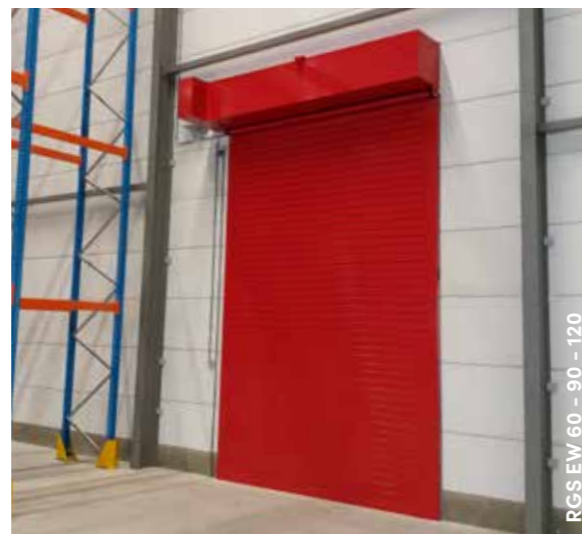
RGS EW 60 - 90 - 120