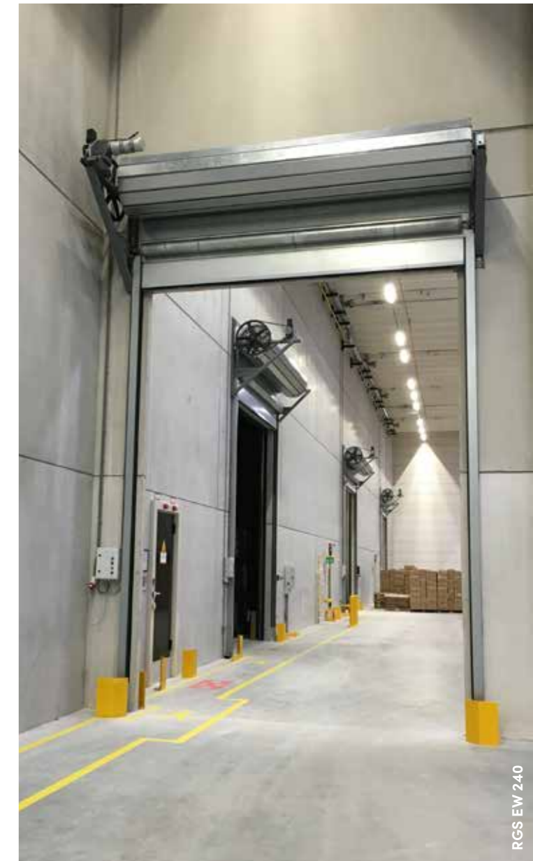
RGS EW 240